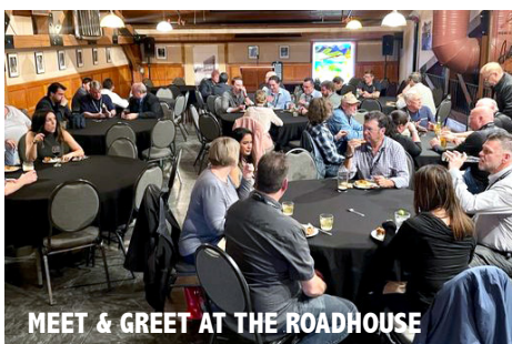
MEET & GREET AT THE ROADHOUSE