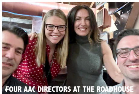
FOUR AAC DIRECTORS AT THE ROADHOUSE